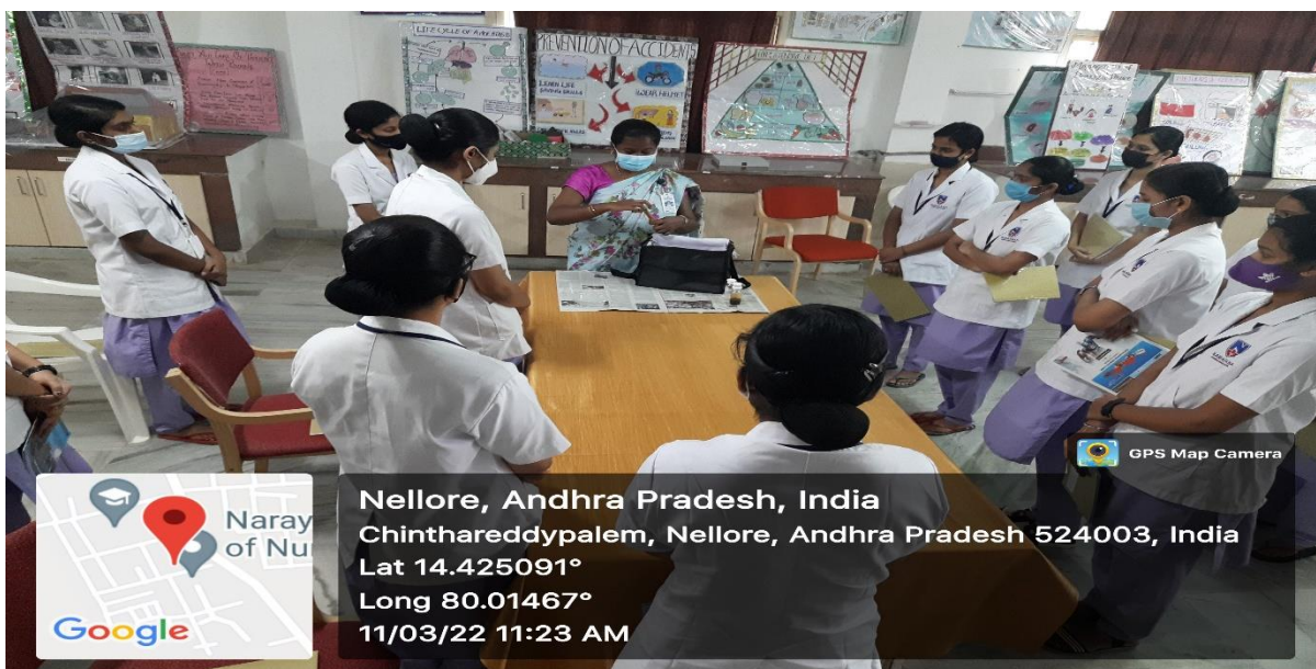
COMMUNITY LAB – DEMONSTRATING BAG TECHNIQE